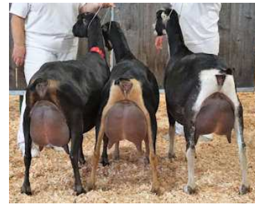
1st Place Sr. Get of Sire