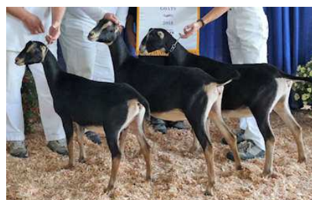
1st place Junior Best 3 Females