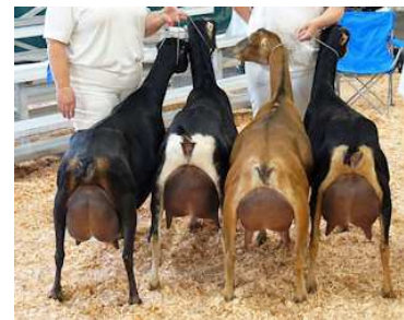
1st Place Dairy Herd