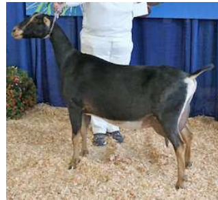
1st Place 4 year old