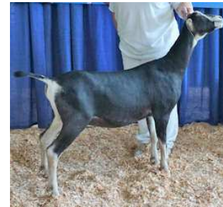
1st place Sr. Kid