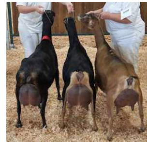
1st Place Breeder's Trio