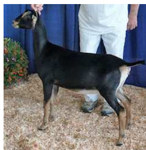
1st place Late Jr.. Kid Res. Jr. Grand Champion