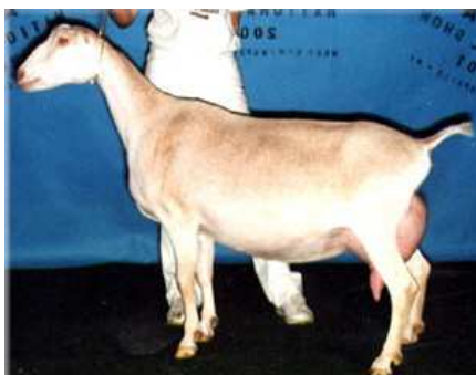
GCH Kastdemur's Citra 2*M EX92

Tumult went on to produce numerous lovely offspring, but the "magic" cross was with SGCH Kastdemur's Sprite 1*M EX 92. Together they produced 8 daughters, of which there were 7 GCH/SGCH, 1 SG and the 9th was a Spotlight Sale consignment that unfortunately died young. The daughters included: SGCH Kastdemur's Seven Up 2*M EX91, 2001 ADGA Reserve National Champion and 3X winner of her National Show class