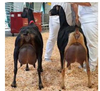
1st Place Produce of Dam