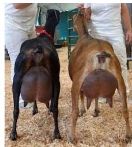
1st Place Dam & Daughter