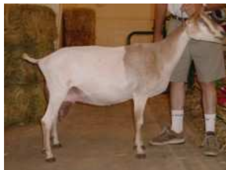
GCH Kastdemur's Survivor 2*M EX91, 3X 1st place at Nationals