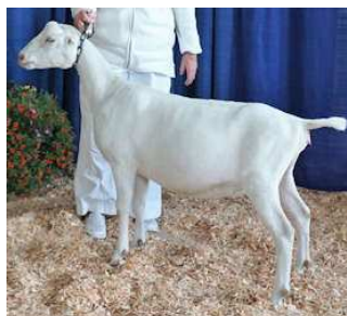
1st place Intermediate Kid Jr. Grand Champion Doe