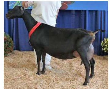
1st Place 5 & 6 yr old Sr. Grand Champion