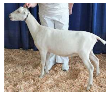
1st Place Jr. Kid