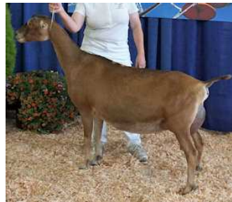
1st Place 3 year old Res. Sr Grand Champion Best Udder of Breed