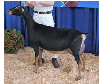
1st Place 2 year old