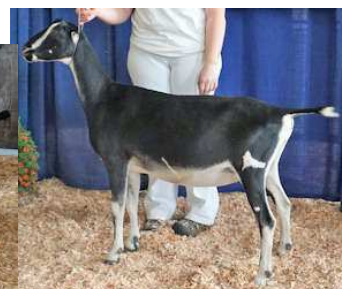
1st place Dry Yearling