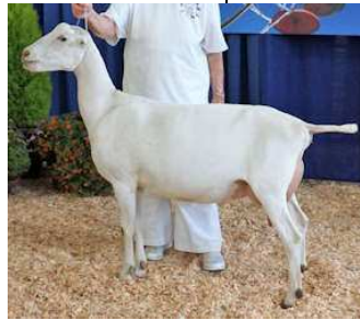
1st Place Yearling Milker