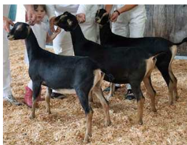
1st place Jr. Get of Sire