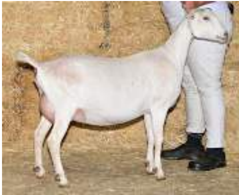
1st Yearling Milker Starlet Lace Toi Rihana