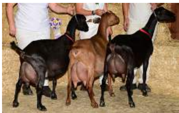
1st Best Three