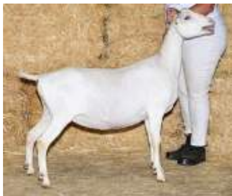
1st Dry Yearling Starlet Lace Pauling Rambulan Res. Grand Champion Jr. Doe