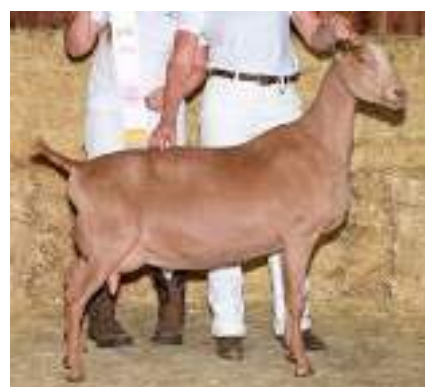
Res. Best Udder B.J. Kids Capt Marvel