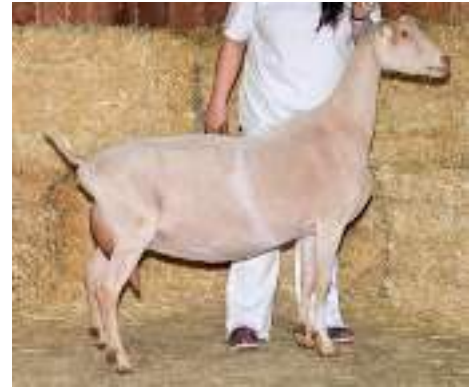
1st Three Year Old Kastdemur's Purple Tang