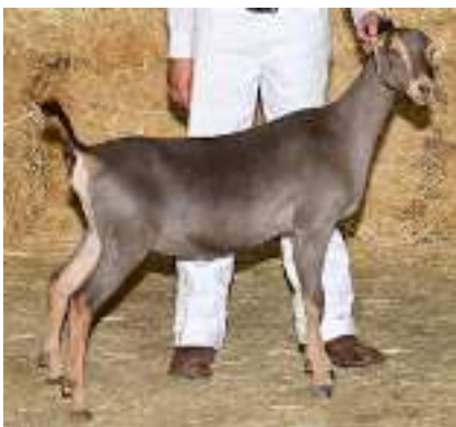
1st Junior Kid Razor Crest Ranch Wookie