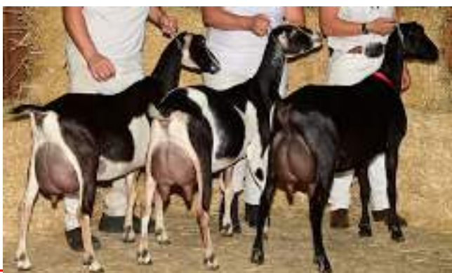
1st Senior Get of Sire Get of Clovertop's Liberty