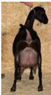
Best Udder Starlet Lace Librty Peppercorn