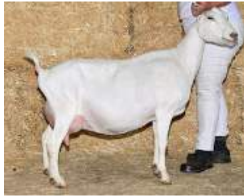
1st 5 & 6 Year Old Starlet Lace Pear Keladry