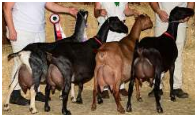
1st Dairy Herd