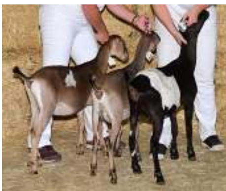
1st Junior Get of Sire Get of Sarah's Own Fleetwood