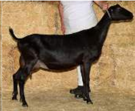
1st Two Year Old Starlet Lace Librty Peppercorn Grand Champion Senior Doe