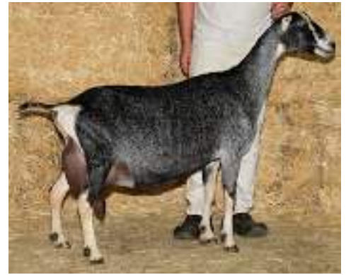
1st 7 & Over Powder Horn PHM Cerulean Res. Grand Champion Sr. Doe