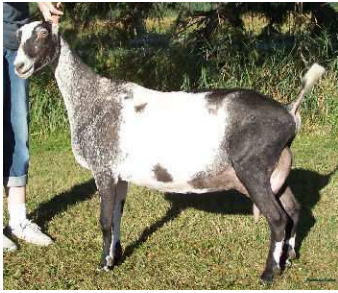
SGCH Opportunity Colors Going Grey 1*M 8-04 92 EEEE B: Kailey Koopman