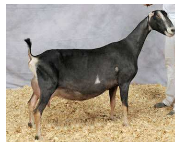
SGCH Calico Patch Oreo Cookie 1*M 8-03 91 EEEE B/O: Samantha Nagel, Calico Patch