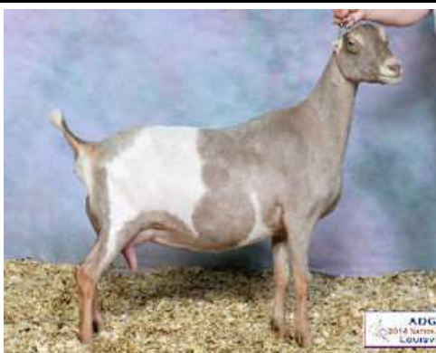
GCH Raintree KAD Kalinda 3*M