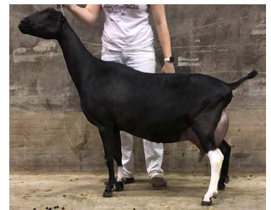
SGCH Kastdemur's Bora Bora 5*M 5-06 91 VEEE