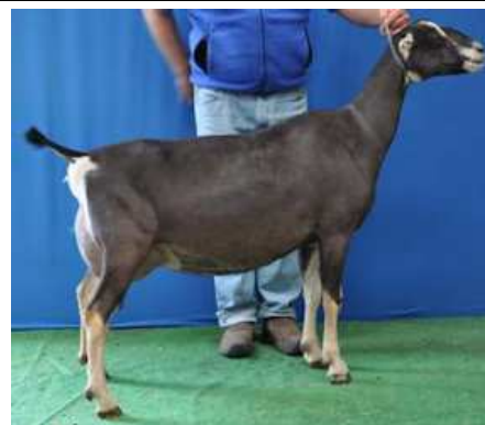
SGCH Lucky*Star's Lot Vivian 4*M

Dam: SGCH Lucky*Star's RY Zaray 4*M L1481753