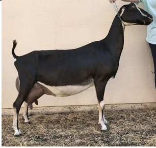
SGCH Love Acres Copperfield Ember 1*M 4-00 304 4170 155 114

Pink Diamond Earring Award ~ Permanent Champion with production of 3500# Milk or 140# Fat or 112# Protein