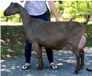
GCH Kastdemur's Vienna 5*M