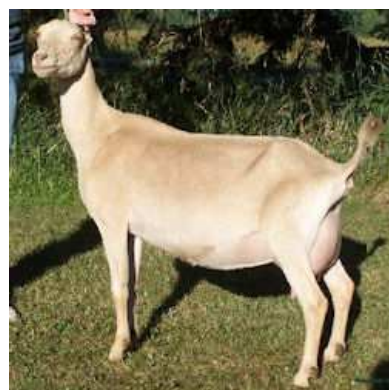
GCH Raintree PX Tawny 3*M