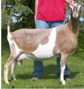
Liberty Ladies ON Rainy Day 1*M

Silver Earring ~ 2500-2999# Milk, 100# Fat or 90# Protein