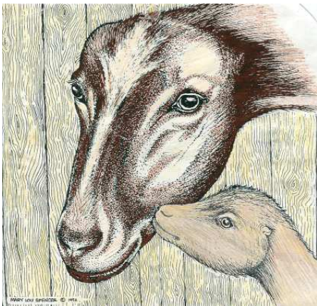
LaManchas, French & American Alpines

We really encourage you to renew your membership using the Paypal buttons on the website at www.lamanchas.org/index.htm