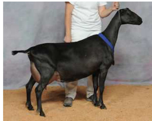
SGCH Kastdemur's Vintage 5*M

2005 National Grand Champion & Best Udder