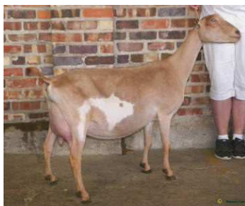
Opportunity Orange Charade 1*M 6-05 92 EEEE B: Kailey Koopman