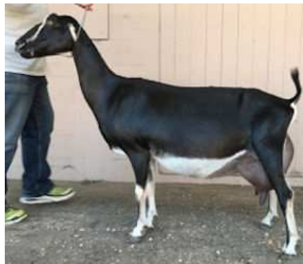
SGCH Love Acres Copperfield Ember 1*M

Dam: GCH Rockin-CB RZEE Azygous 6*M E1533323