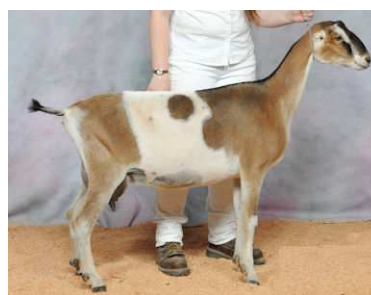
Literate LaManchas Jabberjay 6*M