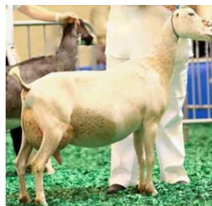
SGCH Texas Dynamite CM Rosie 2*M