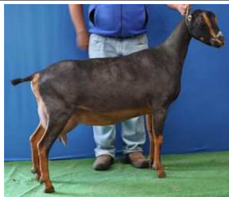
SGCH Lucky*Star's AV Xiang 4*M

Dam: GCH Lucky*Star's QM Noteworthy 1*M L1150135