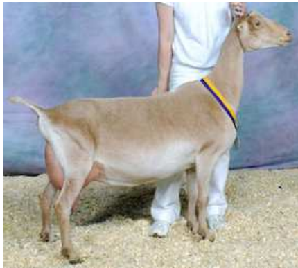
SGCH Kastdemur's Avena 3*M