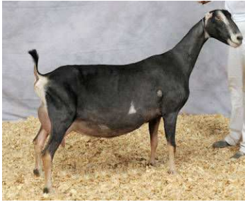
SGCH Calico Patch Oreo Cookie 1*M 8-03 91 EEEE B/O: Samantha Nagel, Calico Patch