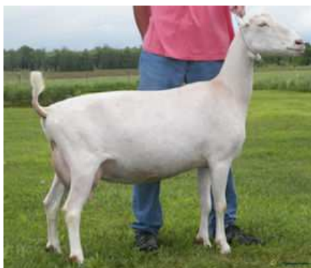
GCH Jen-Mae-Ka Kids Fortune 4*M