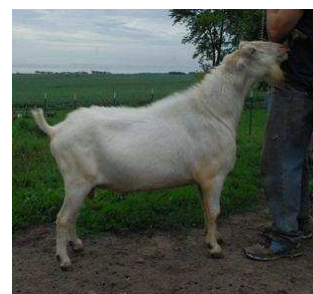
+*B Forrest-Pride Captain Ahab O: Terri & Carey Prigge, Linden Acres B: Andrea Forrest, Forrest-Pride

SG Calico-Lane Win Twilight 4*M 2-10 305 4020 157 128 Calico Fields Win Rue 1*M 3-10 305 3300 127 104 SG Raintree Win Truffle Swirl 4*M 2-00 305 3420 139 105 SG Raintree Win Toffee Swirl 4*M 2-00 305 3220 129 102