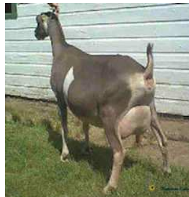
SGCH Raintree Eros Coco 1*M

Dam: SG Raintree Calypso Truffles 2*M L1320702