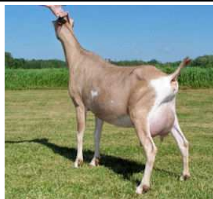
SGCH Raintree OL Cricket 2*M

Dam: SGCH Raintree OL Cricket 2*M L1400821P