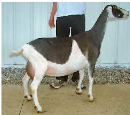
GCH Mint*Leaf Kaity 1*M L1506721