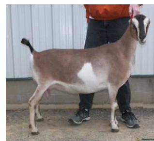
56&Company CR Vanilla Sky 5*M