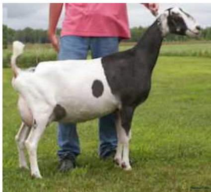
GCH Calico Patch DS Snickers 2*M L1760496