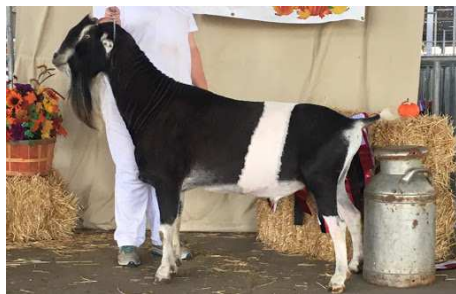
++*B SGCH Kastdemur's SA Stingray Breeder of Buck: Kastdemur's