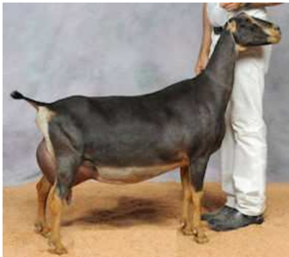
SGCH Rockin-CB LSA First 10*M L1733684