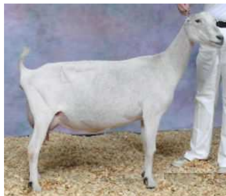
SGCH Tempo Pavlovna 9*M L1439341