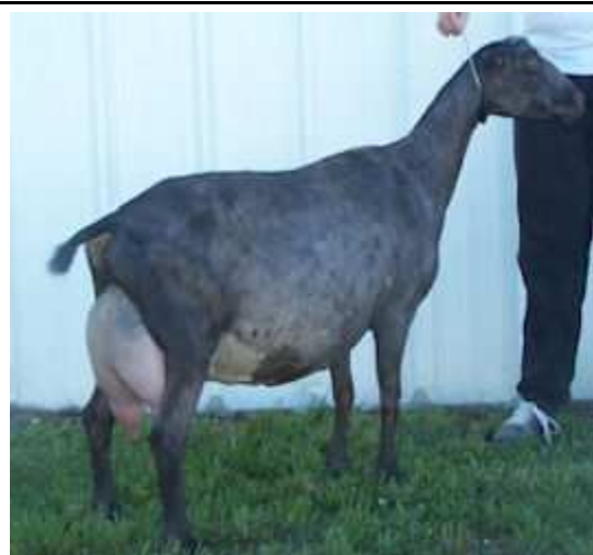
SGCH Raintree EZ Kalista 3*M