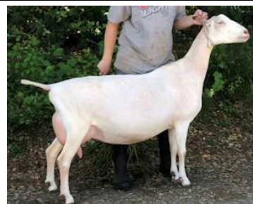
GCH Kastdemur's Versailles 5*M 4-04 91 VEEE B/O: Krista Myers, Kastdemur's