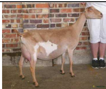
Opportunity Orange Charade 1*M

Silver Earring ~ 2500-2999# Milk, 100# Fat or 90# Protein