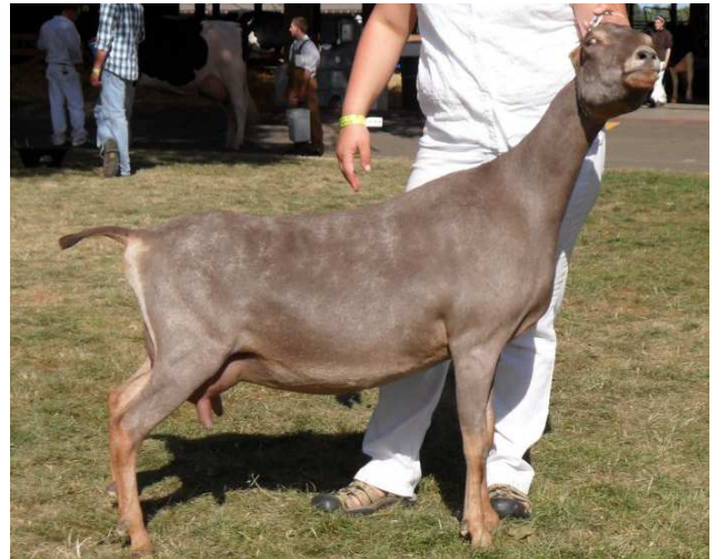
SGCH Barnowl Boucle Q 4*M L1452066

Dam: SGCH Barnowl Bewitched 1*M L1199076