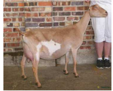
Opportunity Orange Charade 1*M 6-05 92 EEEE B: Kailey Koopman