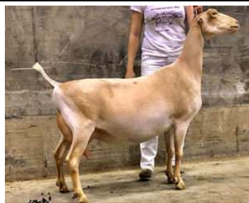
GCH Kastdemur's Riviera 4*M 3-06 92 EEEE B/O: Krista Myers, Kastdemur's