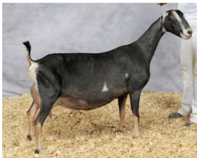
SGCH Calico Patch Oreo Cookie 1*M