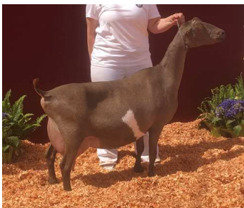
GCH Kastdemur's Wicked 6*M 5-02 92 EEEE