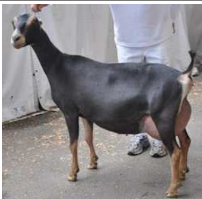
SGCH Lucky*Star's Lot Xhibit 2*M