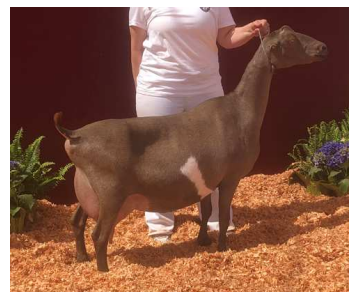
GCH Kastdemur's Wicked 6*M 5-02 92 EEEE B/O: Krista Myers, Kastdemur's