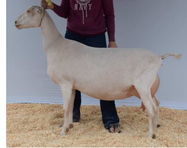
GCH Kastdemur's Vera Wang 6*M