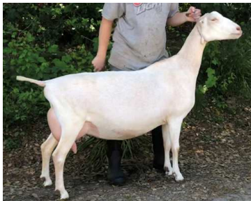
GCH Kastdemur's Versailles 5*M