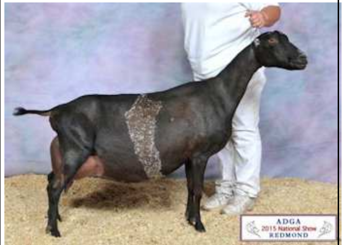
SGCH Rockin-CB RZA Assam 7*M L1514186