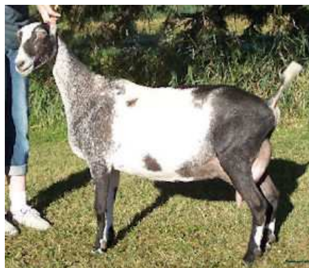
SGCH Opportunity Colors Going Grey 1*M L1569208

Breeder: Samantha Nagel, Calico Patch (youth)