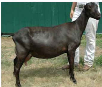
Platte Valley Karma 2*M

Silver Earring ~ 2500-2999# Milk, 100# Fat or 90# Protein ~ Owner Sampler Record