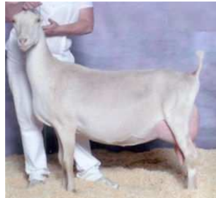
SGCH Kastdemur's Evian 2*M