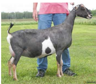
Calico Fields Win Rue 1*M

Lifetime Award ~ 10,000# Milk, 400# Fat or 320# Protein