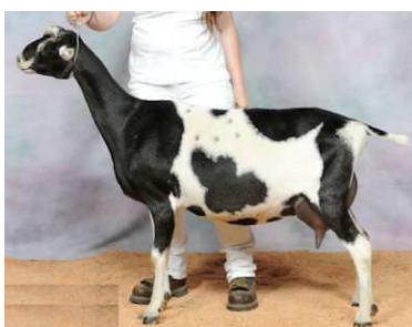
SG Literate LaManchas Tiger Lily 6*M