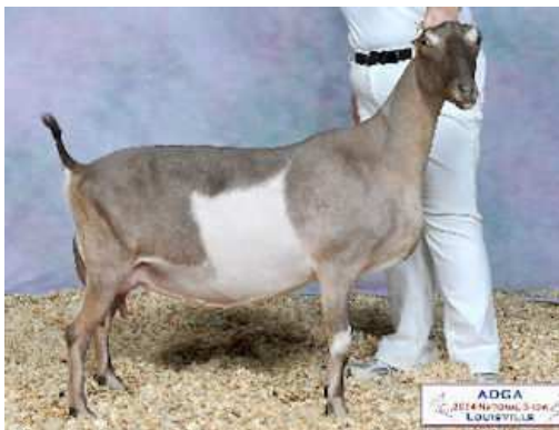
SGCH Raintree OL Caramel Swirl 3*M