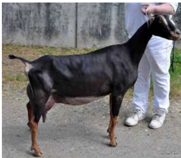
SGCH Lucky*Star's RY Zaray 4*M

Dam: Lucky*Star's QM Vision Stone 3*M L1325480