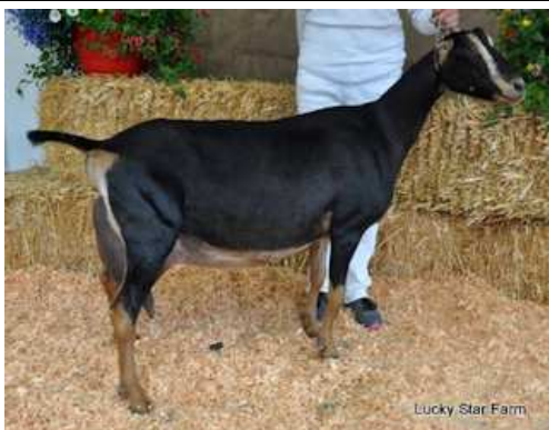
SGCH Lucky*Star's LX Emmaray 5*M