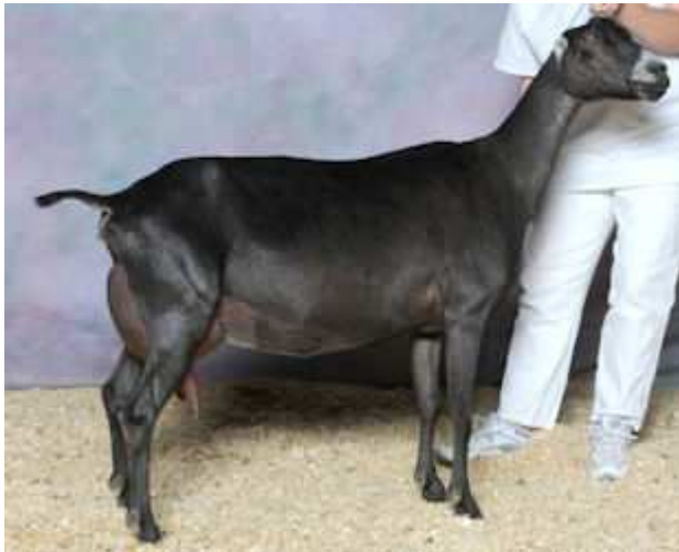
SGCH Barnowl Buffy 2*M AL1296109