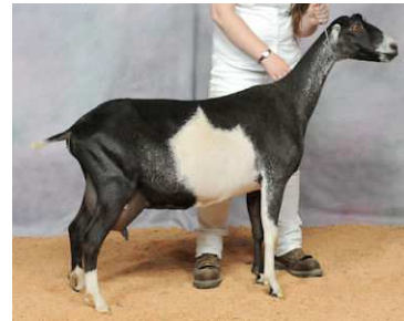
SG Olentangy Stingray Hestia 4*M