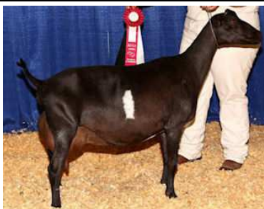
SG Platte Valley Kismet 1*M

Lifetime Award ~ 10,000# Milk, 400# Fat or 320# Protein ~ Owner Sampler Record