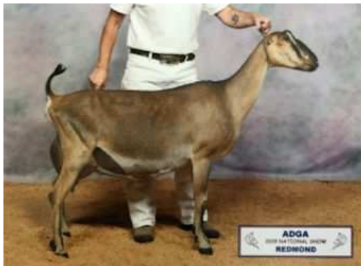
SGCH Love Acres STE Almondine 7*M