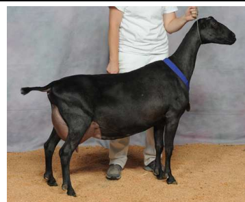
SGCH Kastdemur's Vintage 5*M