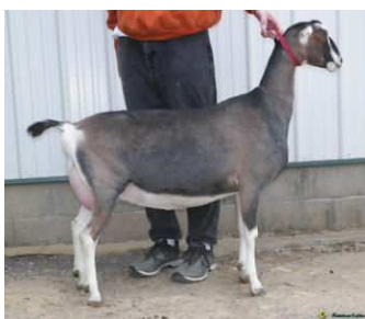
Calico Fields Sin's Raven 2*M