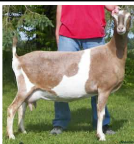
Liberty Ladies ON Rainy Day 1*M 3-04 90 VEVE B: Doni DeVincent O: Sara Cordle, Cordle Farm