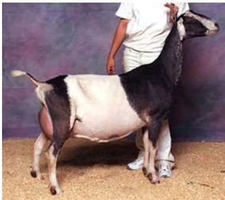
SGCH Kastdemur's Slice 3*M

2009 National Grand Champion & Best Udder