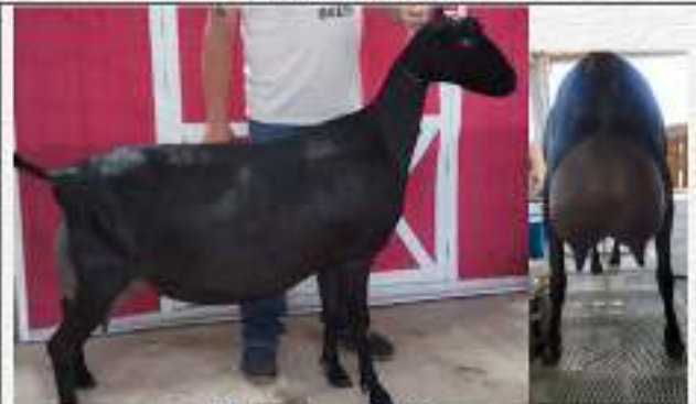
Mt.-River Ranch MLJ Legacy B/O: Myers-Cox Family