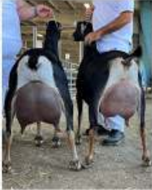
Produce of SGCH Kastdemur's Vintage 5*M B/O: Kastdemur's Dairy Goats

Experimental and Recorded Grade Does Must meet LaMancha Breed Standards