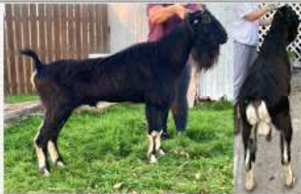
Dreamy Delights B Birch B: Dreamy Delights O: Allison Ode, Two Trees