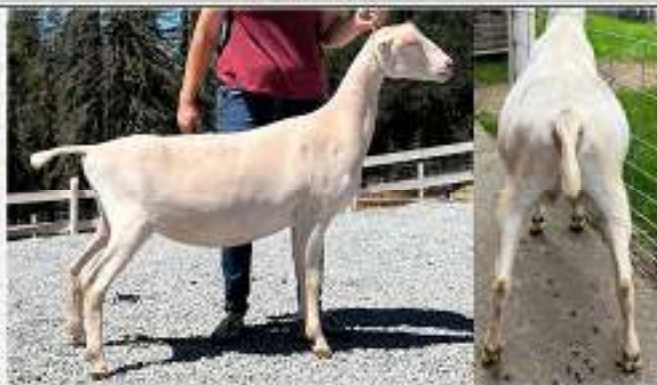
Kastdemur's Lanai B/O: Kastdemur's Dairy Goats