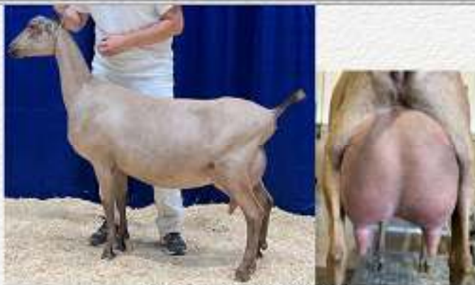
Kastdemur's Aloe Vera 7*M B/O: Kastdemur's Dairy Goats