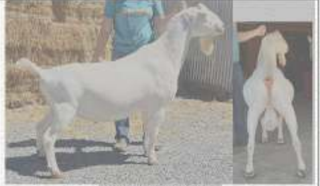
*B Kastdemur's Belmont B/Q: Kastdemur's Dairy Goats