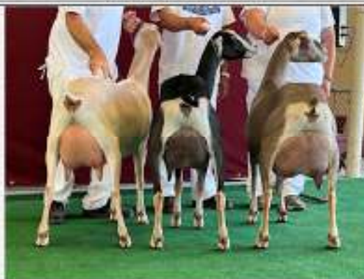
Get of +B Autumn-Acres Titanium O: Kastdemur's Dairy Goats