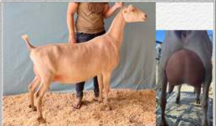
Kastdemur's Vashti 6*M B/O: Kastdemur's Dairy Goats