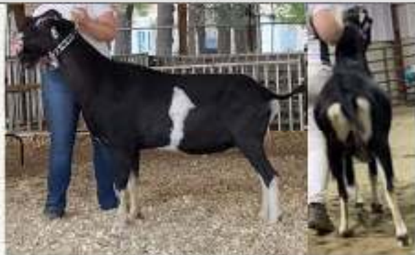
Jen-Mae-Ka Kids Take A Bow B: Jen-Mae-Ka Kids O: Kitty Pielemeier, Flim Flam Farms "Supreme Champion Buck"