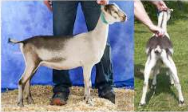
Calico-Acres Blazing FirePoppy B/O: Sharla Macke, Raintree-Calico