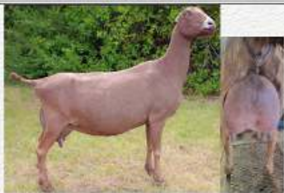
CH Sapphire W 4 D Lady Claire B/O: Myers-Cox Family