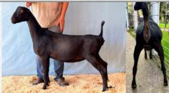
Kastdemur's Pennyroyal Tea B/O: Kastdemur's Dairy Goats