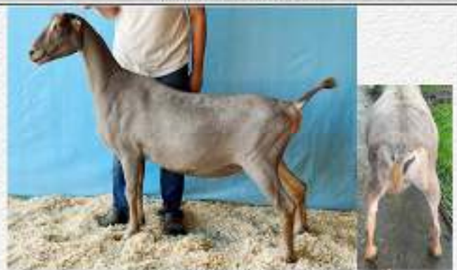
Kastdemur's Primavera B/O: Kastdemur's Dairy Goats