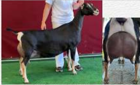
GCH Kastdemur's Va Va Voom 6*M B/O: Kastdemur's Dairy Goats