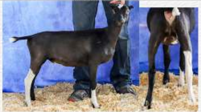
Calico-Acres Blazing Haven B/O: Sharla Macke, Raintree-Calico