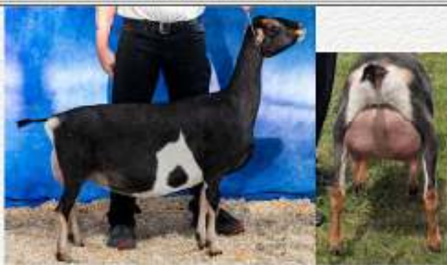
GCH Calico Fields Win Rue 1*M B/O: James Olson-Nagel, Calico Fields