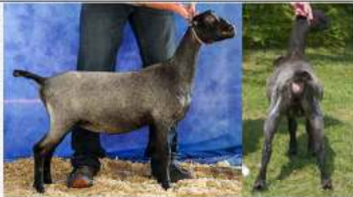
Raintree WS Twinkie B/O: Deb Macke, Raintree-Calico