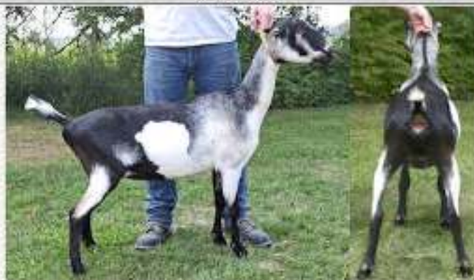
Shady Lawn Crede's Pandora