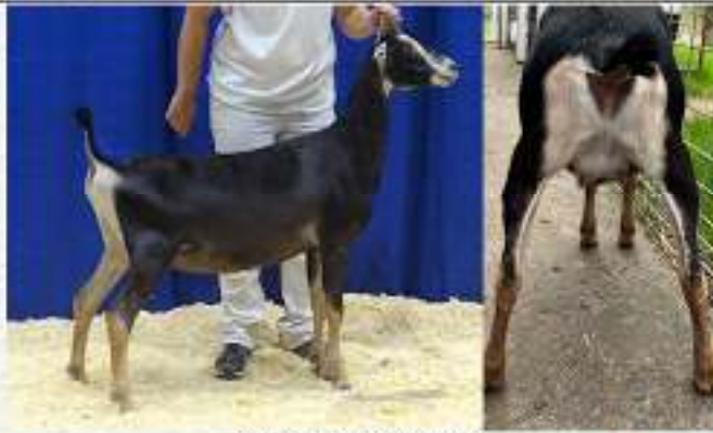
Kastdemur's Bamboo B/O: Kastdemur's Dairy Goats