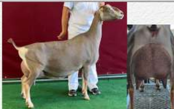
GCH Kastdemur's Mambo #5 6*M B/O: Kastdemur's Dairy Goats *Supreme Champion Doe & Best Udder Purebred*