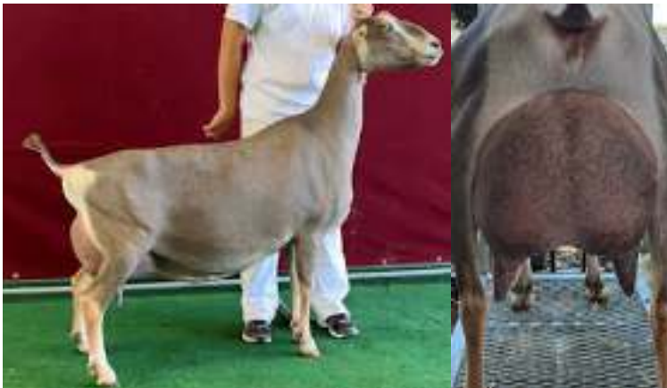
GCH Kastdemur's Mambo #5 6*M B/O: Kastdemur's Dairy Goats ALBA All American Supreme Doe