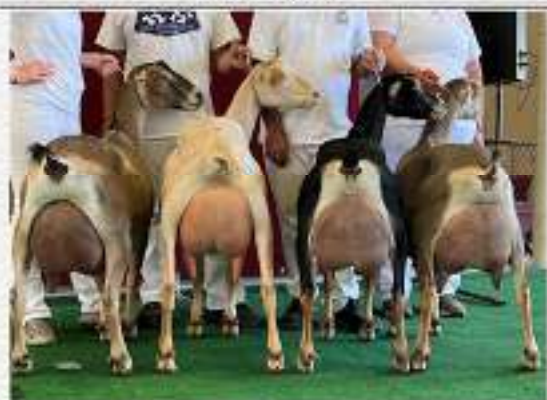
Kastdemur's Dairy Goats