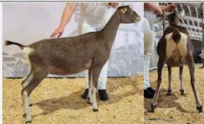
Flim Flam Farms AAN Koana