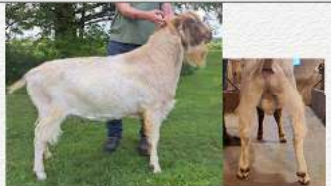
*B South-Fork SD Clarence B: South-Fork O: Deb Macke, Raintree-Calico