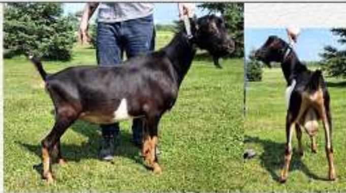
Easter Valley Semtex S'More B: Easter Valley O: Deb Macke, Raintree-Calico