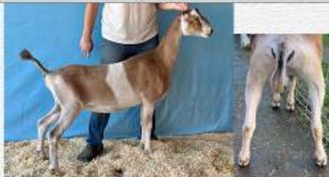
Kastdemur's Savvy Chic B/O: Kastdemur's Dairy Goats