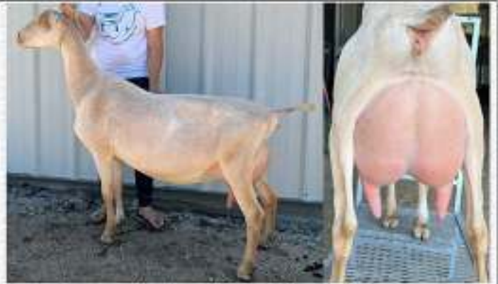
Kastdemur's Purple Tang 1*M B/O: Kastdemur's Dairy Goats