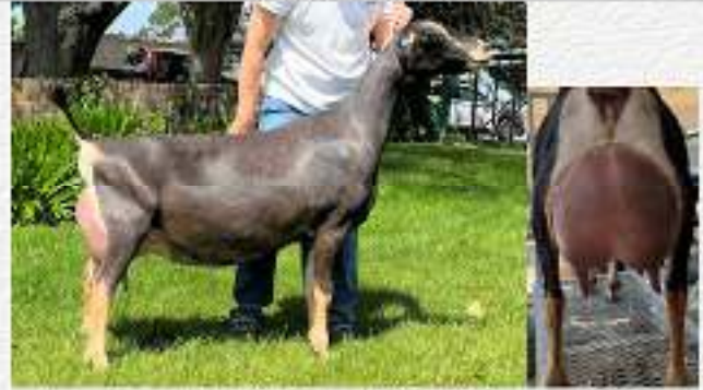
GCH Kastdemur's Vixen 6*M B/O: Kastdemur's Dairy Goats