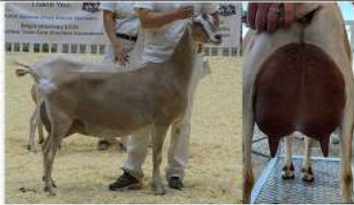
Kastdemur's Couture 8*M B/O: Kastdemur's Dairy Goats