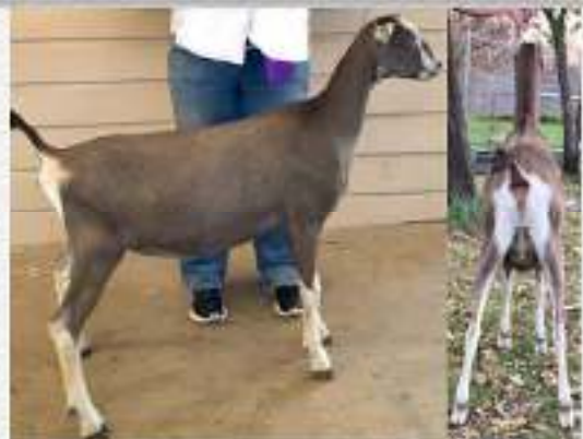
Two Trees Echo Rose B/O: Allison Ode, Two Trees