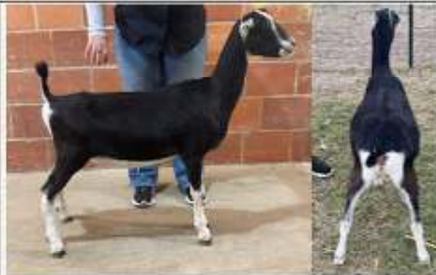
The Easter Orchid B/O: Allison Ode, Two Trees "Youth" ~ "Grand Champion Junior Doe ~ Older Youth"

Class 2: Intermediate Kids ~ born March 2023 ~ 3 entries