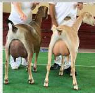
GCH Kastdemur's Avalon 5*M Kastdemur's Paradise 6*M B/O: Kastdemur's Dairy Goats