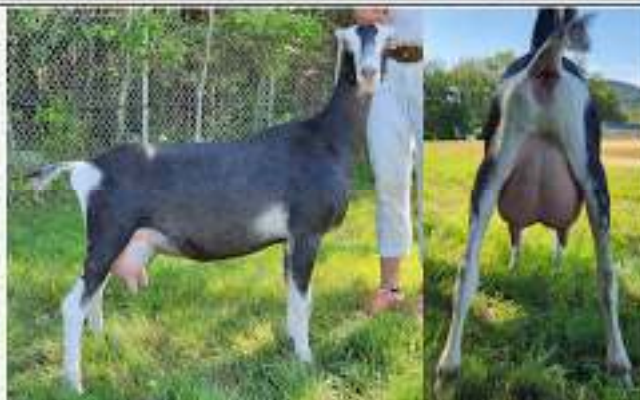
Eden-Made DB Betty White