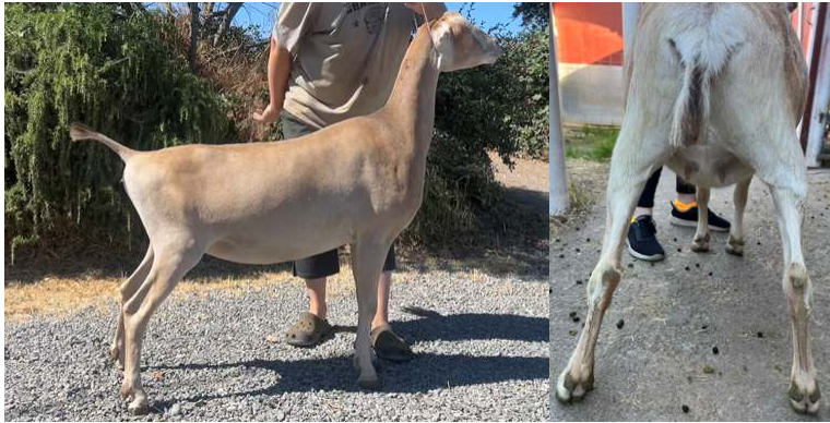
Kastdemur's J'Adore B/O: Kastdemur's Dairy Goats