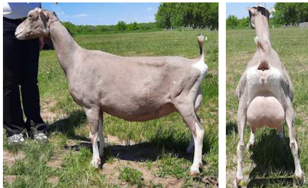
4JB RRF/Choca's Deliah 1*M