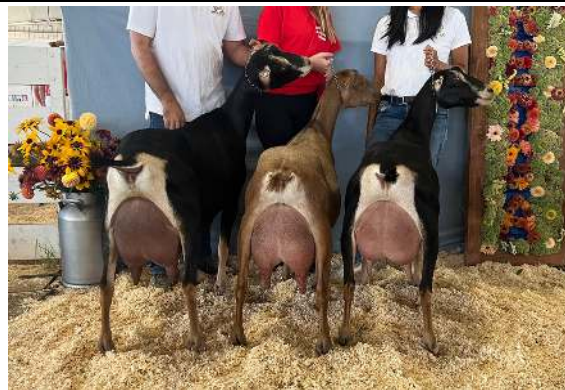
Get of +*B SG Rockin-CB KR Hoku O: Kastdemur's Dairy Goats

Class 23: Rec. Grade Junior Kids ~ 2 entries