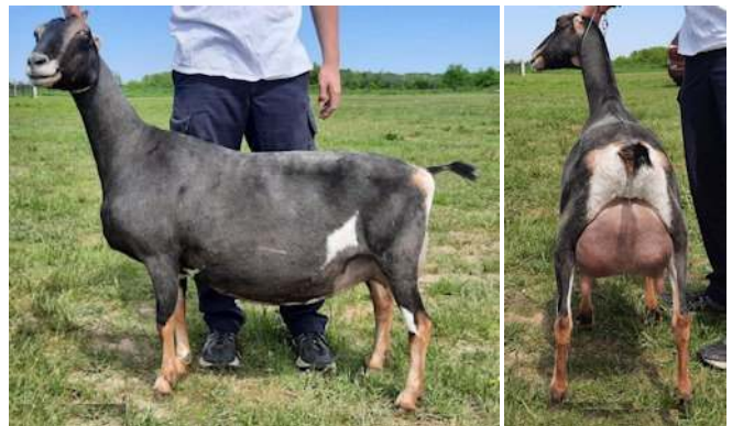
GCH (pend) Calico Fields Win Rue 1*M