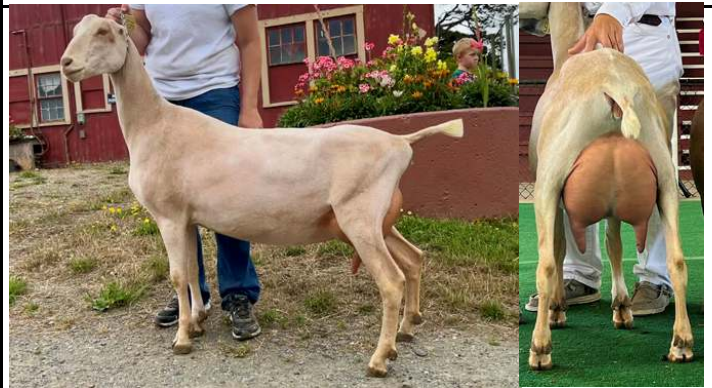
Kastdemur's Purple Tang 1*M B/O: Krista Myers, Kastdemur's Dairy Goats