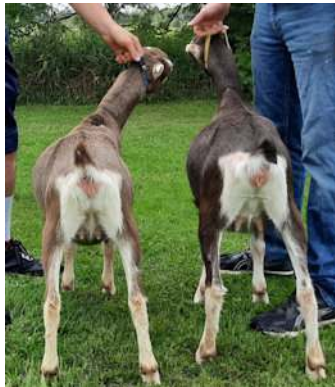
Produce of Royal Cedars Robin's Sparrow