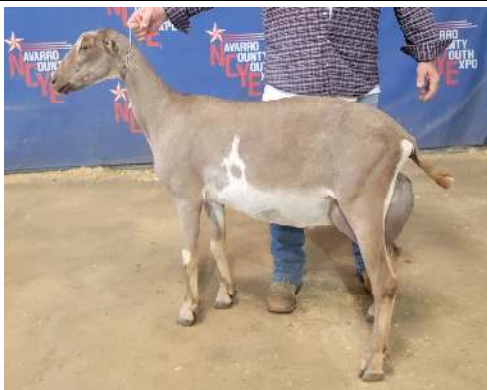
Majenli JF Kiska