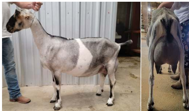
Teats-N-Tails Flowbug O: Christina Cox, Mt.-River Ranch