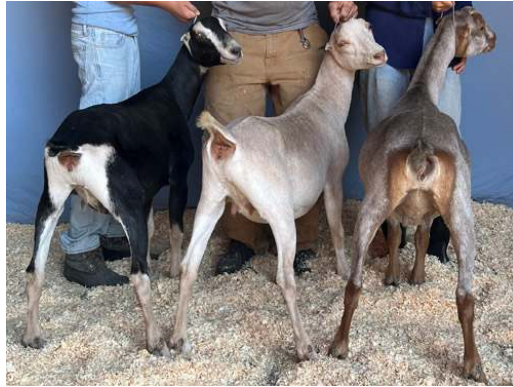
Get of Autumn-Acres Titanium O: Kastdemur's Dairy Goats