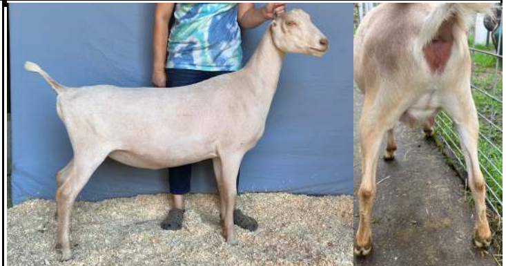
Vineyard View LV Cream B/O: Scott Bice, Vineyard View