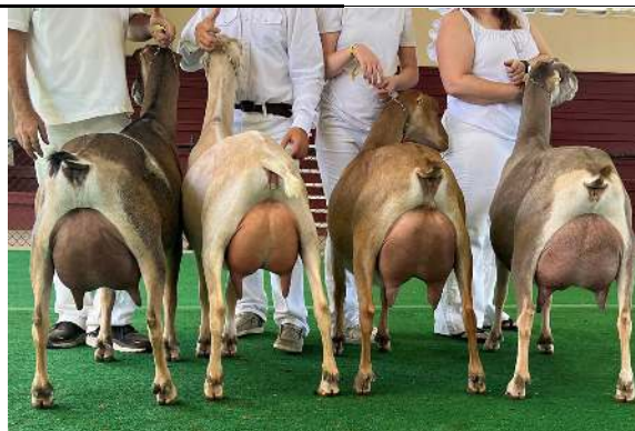
O: Kastdemur's Dairy Goats