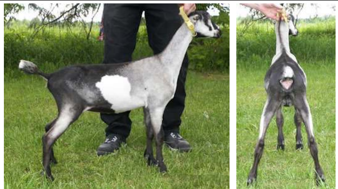
Shady Lawn Crede's Pandora