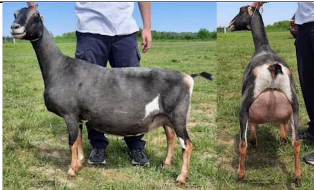
GCH (pend) Calico Fields Win Rue 1*M B/O: James Nagel, Calico Fields "Youth"